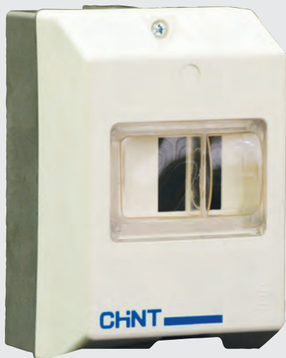
NS2-MC EMPTY ENCLOSURE