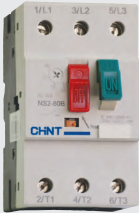
NS2-25 (MMS) MOTOR MANUAL STARTER