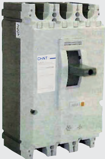
NM8 RANGE THERMAL MAGNETIC RELEASE MOULDED CASE CIRCUIT BREAKER (MCCB)