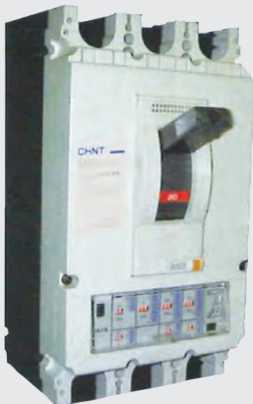
NM8 RANGE ELECTRONIC RELEASE MOULDED CASE CIRCUIT BREAKER (MCCB)