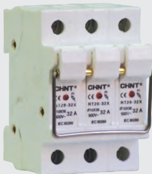
RT28-32-3P FUSE HOLDER DIN MOUNT