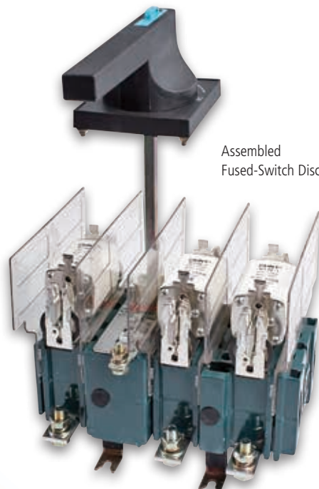
Assembled Fused-Switch Disconnecter